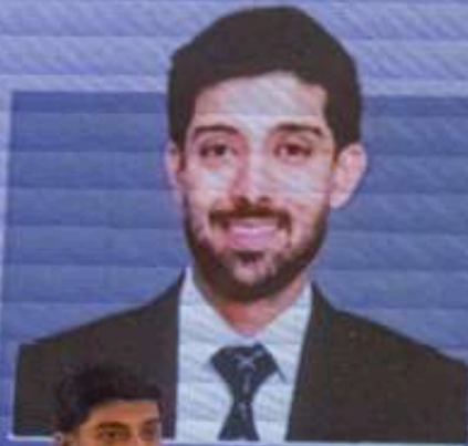
Karan Mehra Portfolio Invest