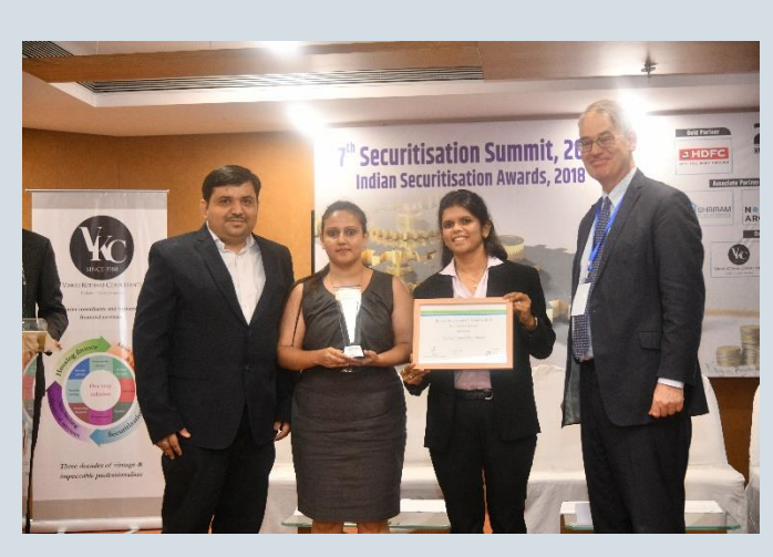
TRUSTEE OF THE YEAR CATALYST TRUSTEESHIP LIMITED