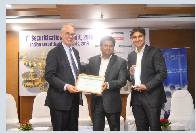
MOST INNOVATIVE DEAL OF THE YEAR VIVRITI CAPITAL PRIVATE LIMITED